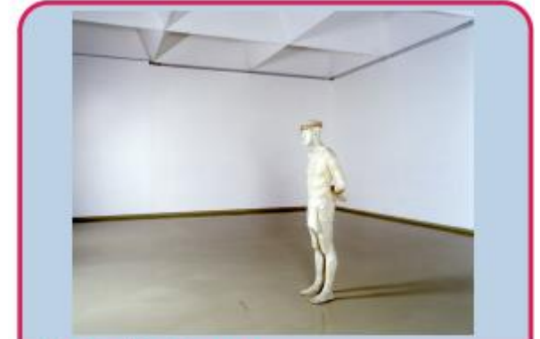
Mark Wallinger A contemporary British artist.

Cubism ignores perspective and artists paint their subjects from lots of different angles.