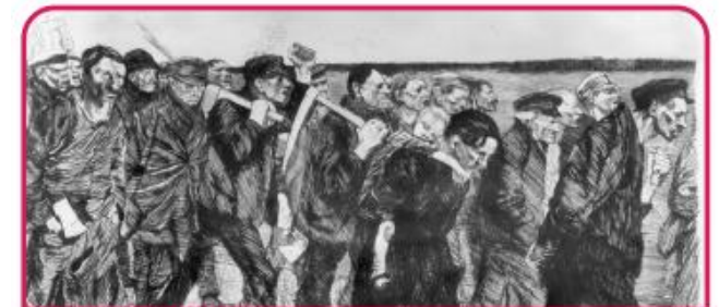
Kathe Kollwitz A German artist who worked with painting, printmaking and sculpture.