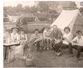
Camping was popular in the 1950s.