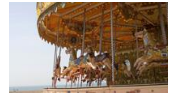
Carousels could often be found at the seaside.