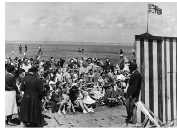
Punch and Judy Shows were popular.