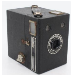
The Box Brownie Camera was a popular Camera for people to take photos with in the 1950s.

Souvenirs help us to preserve memories about our holidays and happy times. People may bring them home for themselves or sometimes as a gift for friends and family.