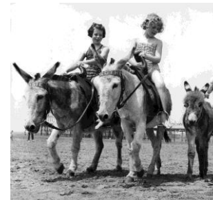
Many people enjoyed donkey rides.