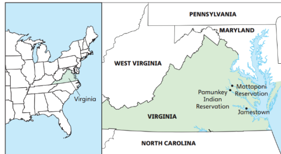
Virginia is on the East Coast of the United States of America