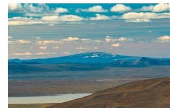
A shield volcano